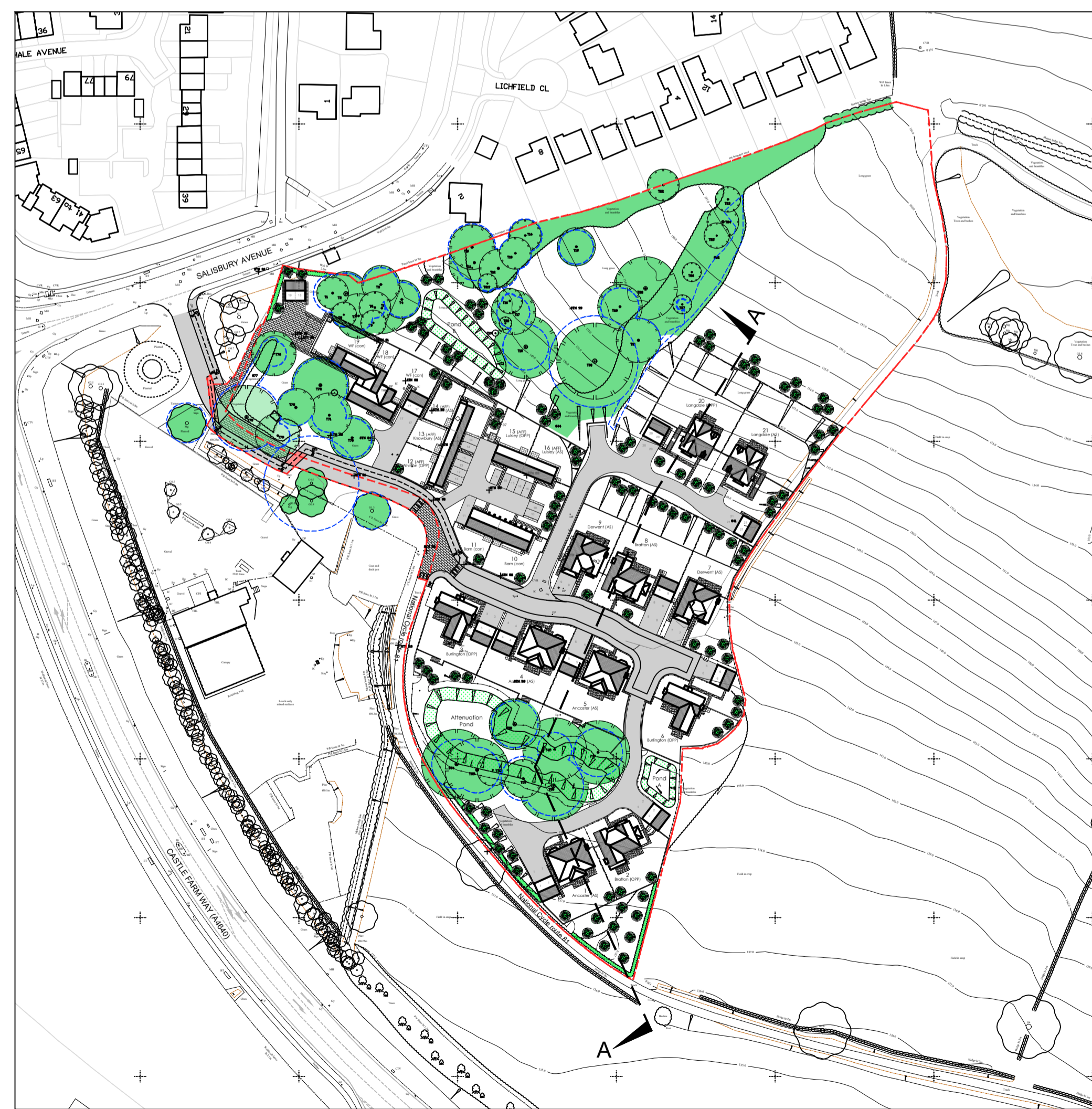
SITE PLAN (1:1250)